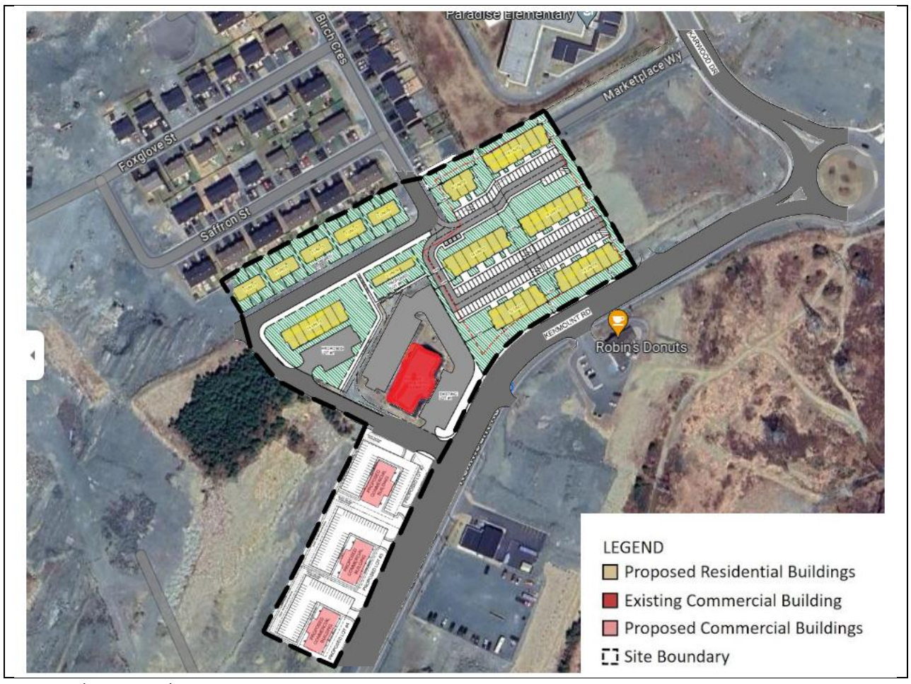
Proposed Concept Plan

The development will be fully serviced and connected to municipal water and sewer services. The majority of the site can be accommodated below the 180 m contour servicing limit. For those portions of the site that are beyond the 180 m contour, a solution will be provided as a means to ensure adequate water pressure, as approved by the Town until such time as a permanent solution is constructed by the Town. All public infrastructure, including roads, sidewalks, pedestrian pathway and water and sewer services will be developed or constructed in accordance with the design standards of the Town of Paradise.