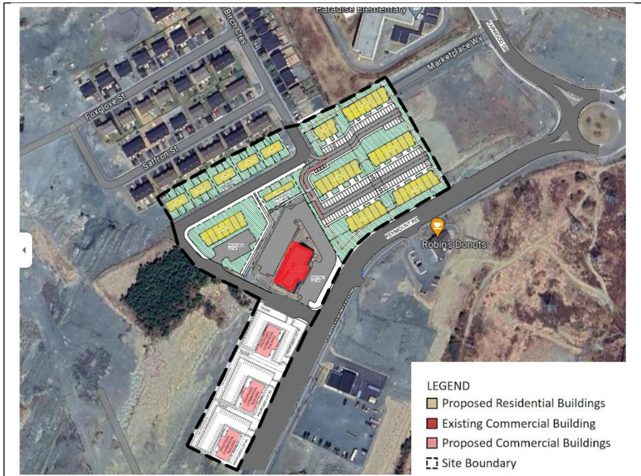
Proposed Concept Plan

The development will be fully serviced and connected to municipal water and sewer services. The majority of the site can be accommodated below the 180 m contour servicing limit. For those portions of the site that are beyond the 180 m contour, water boosters will be installed until such time as the water tower immediately to the north of the subject property is constructed. All public infrastructure, including roads, sidewalks, pedestrian pathway and water and sewer services will be developed or constructed in accordance with the design standards of the Town of Paradise.